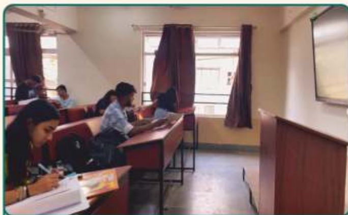
First Year Class Room