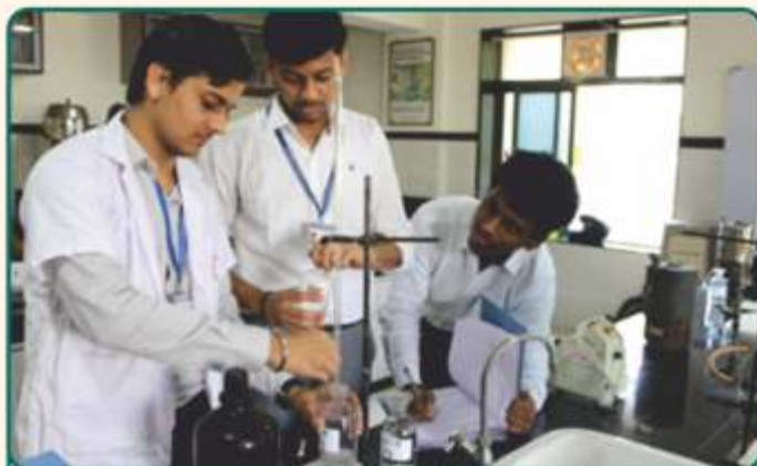
Engineering Chemistry Laboratory