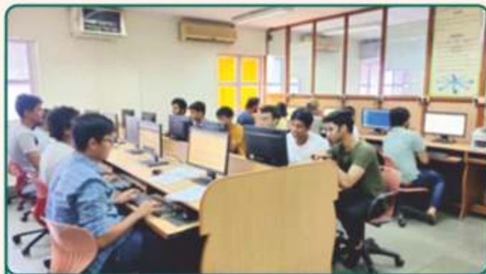
Open Source Lab