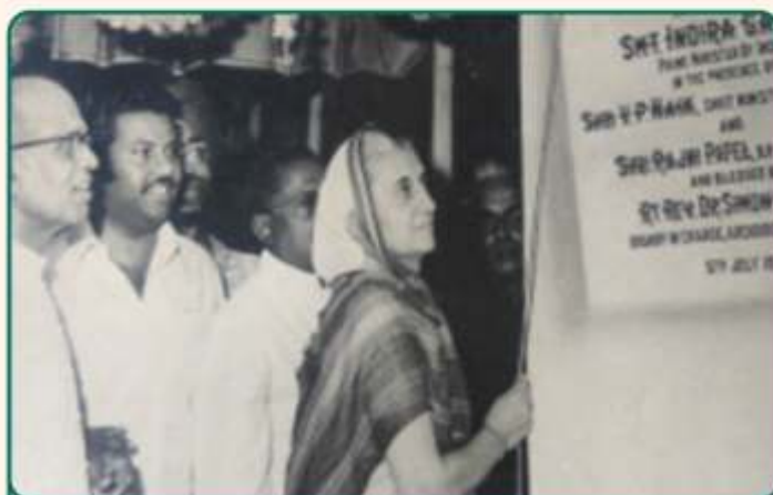
Smt. Indira Gandhi inaugurating the Agnel Technical Complex