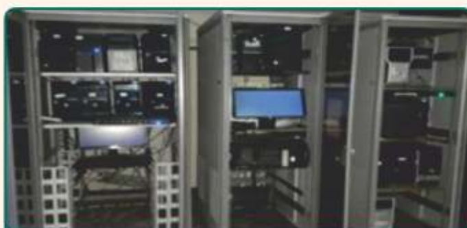
Centralized Server systems