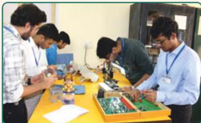
Engineering Physics Laboratory

The Department has competent faculty and excellent infrastructure facilities to fulfill the requirements of the course curriculum. The department organizes a two-week induction program consisting of Yoga sessions, sessions on environmental awareness, lectures on universal human values, expert lectures, interactive sessions with Department heads, Placement Cell, Student Council, etc. The Department has a qualified professional counselor to help the students to sort out their personal and professional issues.