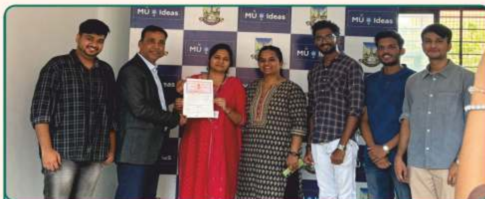
Pre-incubation Agreement with Mumbai University : MU Idea and Incubation centre.