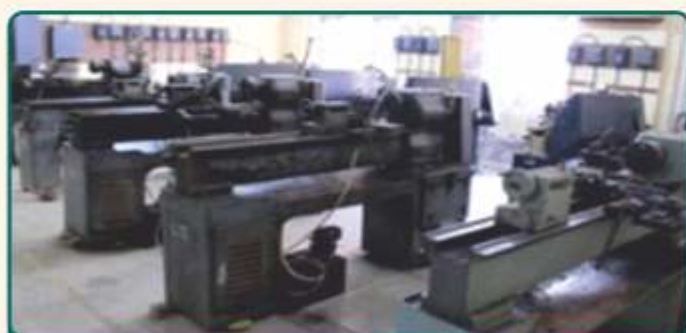
Central work shop