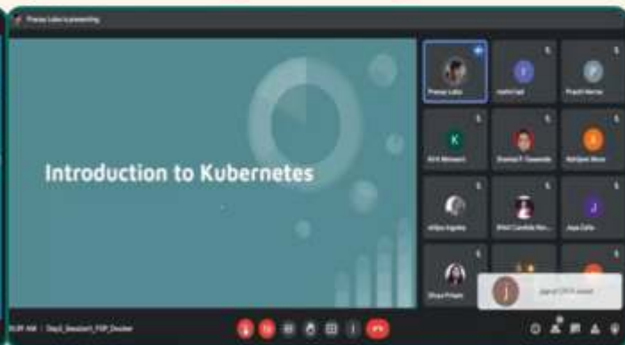
Workshop for students on Advanced cloud computing