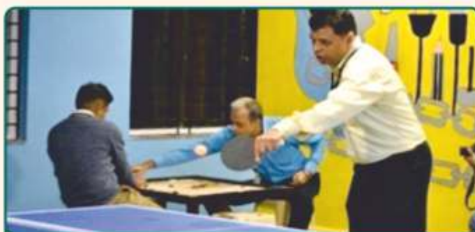
Gymkhana – Boys Common Room