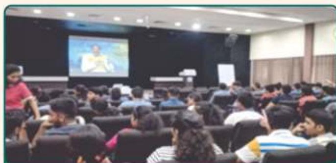
Central Auditorium – Samvaad