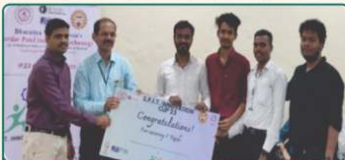
Winner of the Innovation Cup 2023 across all of Maharashtra (state level) at Sardar Patel Institute of Technology by The final year (B.E.) project 'Automatic Electric Vehicle (EV) Charging Station' from the Department of Electronics & Computer Science (ECS)