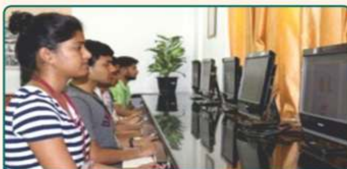
Internet Centre & Digital Library