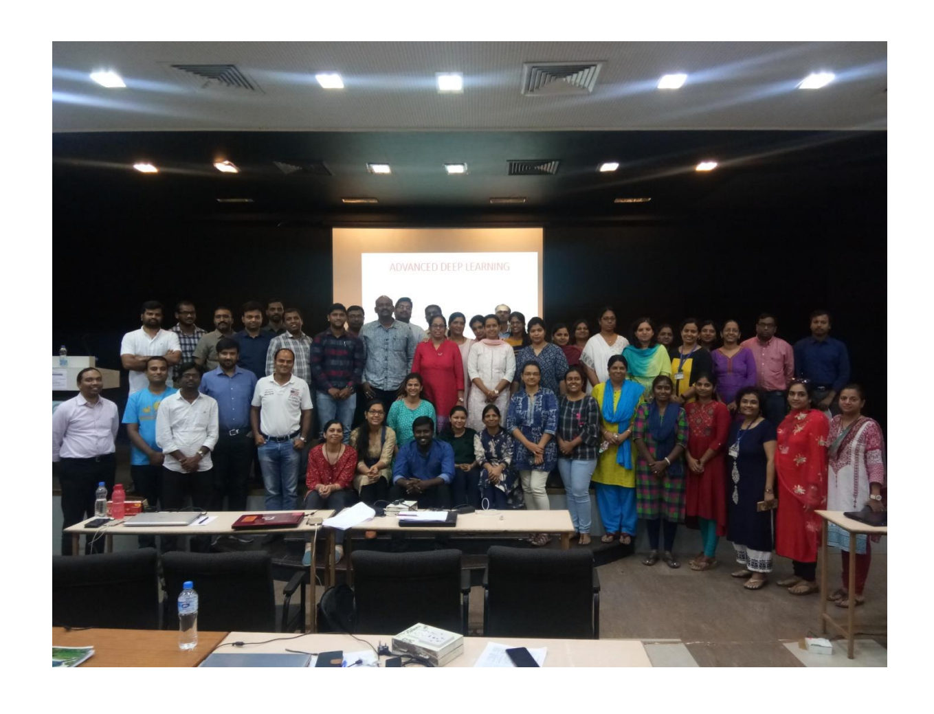
Day2 and 3